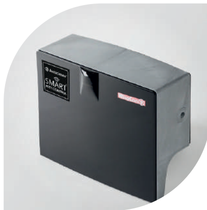
An example of a trap that both catches rodents and monitors their activity.