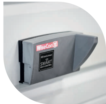
An example of a sensor that can be used as a monitoring device or as a range extender.