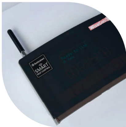
One master control box connects with and controls all traps and sensors.

BASED ON THE STATISTICS from the traps and sensors, we monitor the success rate of the program, provide suggestions for further action and, if needed, make alterations to the program.